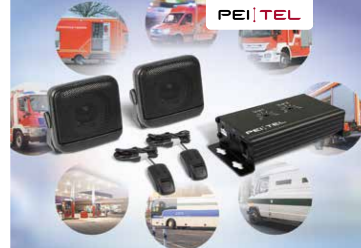
PTIntercom – cascable system for one-way and two-way communication

"As in other divisions, solutions that offer a high degree of flexibility are increasingly in demand for safety-critical communications. With PTIntercom, the individual components can be installed in the relevant locations. Thanks to its modular structure, it can also be supplemented with audio accessories as required," explains Matthias Peucker, Product Manager at pei tel. The product bundle for the retrofittable intercom system comprises an electronics box,