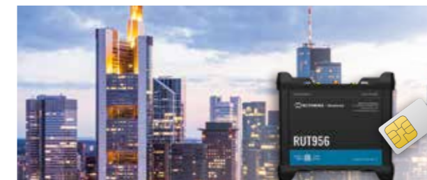
PTSmartMonitoring – remote monitoring and access to indoor radio systems

In PTSmartMonitoring, pei tel also offers a solution that enables straightforward and efficient remote monitoring and access to indoor radio systems.