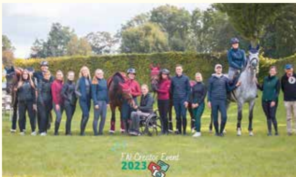
Participants in the 2023 FN Creator Event

Participants enjoyed creative workshops and fascinating talks. The event was open to anyone with a public Instagram