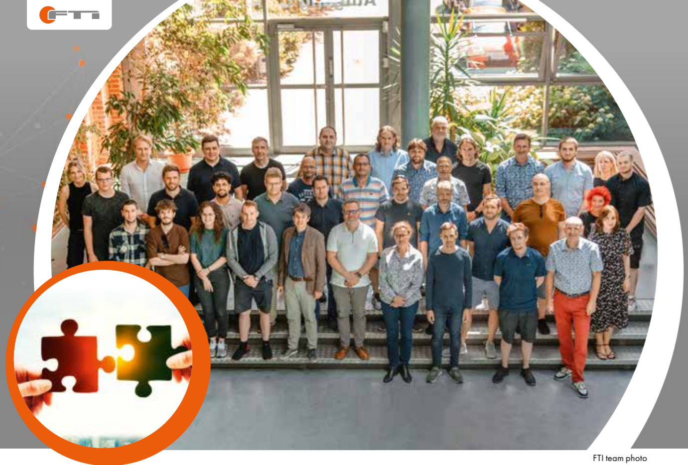
FTI team photo