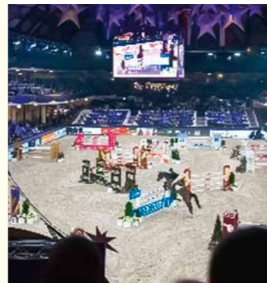
Internationales Festhallen Reitturnier Frankfurt

International Frankfurt Festhalle Riding Tournament 2023