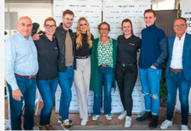
High-profile visit to the peiker CEE GmbH info stand

We are delighted to have been able to support Schaffhof once again this year and look forward eagerly to our future together.