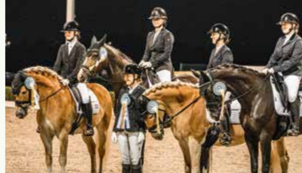
Victory for the Hofgut team