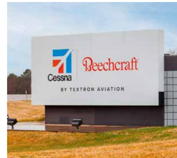
Textron Aviation is a leading force in aircraft construction

Thanks to its employees and partners, FTI is well prepared for the future. With its unwavering focus on future-ready products and markets, the company is on a steady growth course and already has its sights set on the next major issue: AI-based solutions.