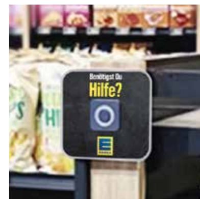
Advice boosts shopping experience at EDEKA

peiECO – AN IN-HOUSE DEVELOPMENT TO SUPPORT TRADITIONAL RETAIL