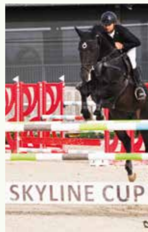
Show jumping under the floodlights

Thursday, the opening day, was dominated as usual by the young horses. They complete less rigorous events to introduce them to tournament events and acquaint them with their future tasks. For some horses, this was their first appearance in