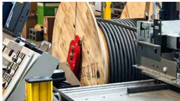
Cable-cutting machine at the Osnabrück site

Big things are happening at pei tel Communications GmbH in Osnabrück: the site, which is responsible for distribution of the company's communication solutions, has now acquired a cable-cutting machine. This means that, instead of set cable lengths, customers can now purchase cables with the required dimensions – and pay only for what they actually need.